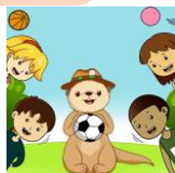
Let's Play After School