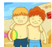
A Fun Summer

www.spongeschool.com | info@spongeschool.com | (425) 274-5188