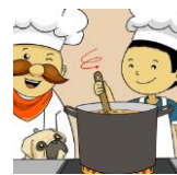
Let's Make a Soup